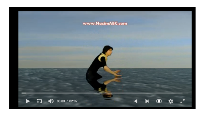
Figure 1 Screen shot of Nasim's video titled "كوسه+گرسنه+و+دختر" <a href="https://archive.org/details/Nasim_Aghdam/%DA%A9%D9%88%D8%B3%D9%87+%DA%AF%D8%B1%D8%B3%D9%86%D9%87+%D9%88+%D8%AF%D8%AE%D8%AA%D8%B1.wmv">https://archive.org/details/Nasim_Aghdam/%DA%A9%D9%88%D8%B3%D9%87+%DA%AF%D8%B1%D8%B3%D9%86%D9%87+%D9%88+%D8%AF%D8%AE%D8%AA%D8%B1.wmv</a>

A young woman swims in an ocean of pixelated waves only delimited by the sky at the horizon, her slim figure at the center of the screen, almost three quarters out of the water. Speaking Persian, she says she enjoys swimming in such peaceful and transparent waters. It's an abstract world, not much more than colors and shapes, not unlike a basic animation or videogame. A shark appears, first the fins, not much more than blue triangles moving on the surface of the sea, then a cartoonlike enormous open mouth about to eat the woman. A conversation follows. The shark asks the woman to provide a logical reason not to eat her. "I am vegan" she says. "Why you did not say it from the start!" the shark replies swimming away. The video ends as it started, with the woman swimming across the saturated blue screen in a limitless ocean.