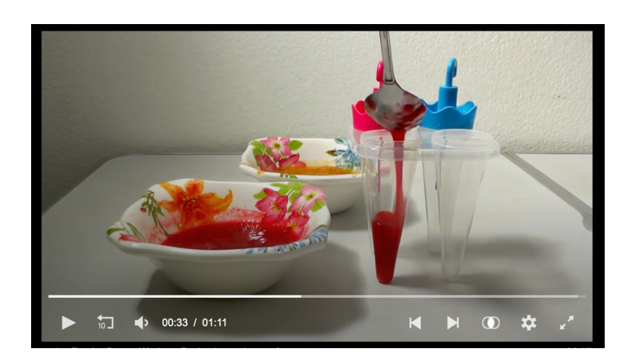
Figure 4 Screen shot from "Fruit Icecream Nasim" <a href="https://archive.org/details/Nasim">https://archive.org/details/Nasim</a> Aghdam/videos/Fruit+Icecream+Nasim.mp4

These spatial and temporal coordinates enclose a world of its own, constituted by the elements that compose it. The outside world is itemized, abstracted and relocated within the frame of the videos. This dislocation is not a complete resignification of the outside, but a movement that re-sizes elements of the outside world to compose them in a different assemblage: the videos' space/time reconfigures the visible in its own terms. Rooms, architectural elements, and furniture as well as electronic landscapes and props appear as décor of the self-contained time/space into which they have been folded. This effect is amplified by the familiarity of the transposed elements. When Nasim is not in the frame, often "found objects" like food or drinks occupy the scene: zooming in and out, the camera places them in a suspended temporality of their own. It's Nasim's world.