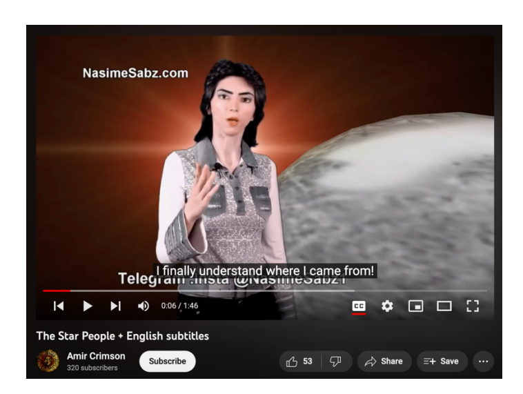
Figure 5 Screen shot from "The Star People" <a href="https://www.youtube.com/watch?v=Z36TW-lt-R0&list=PLtV5Nng">https://www.youtube.com/watch?v=Z36TW-lt-R0&list=PLtV5Nng</a> bGXpx8HuED313V9lcFbEaTO1a&index=12.