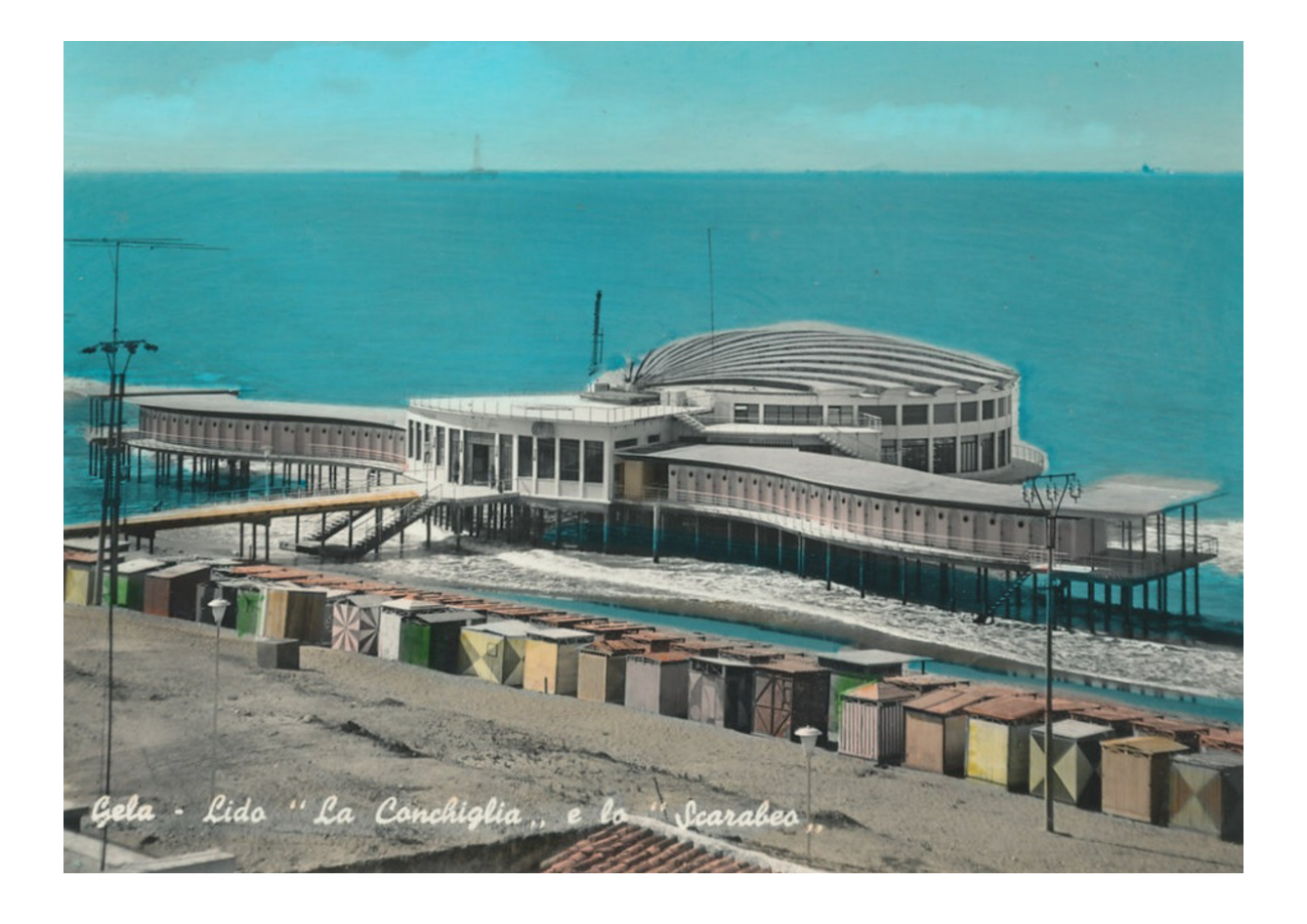
PHOTO 11: Bath-house, "La Conchiglia" (seashell), and, in the background, the "Scarabeo". La Conchiglia was inaugurated in 1958 and enjoyed national fame, hosting social events and personalities from the world of entertainment, culture and politics. It was built in reinforced concrete on the remains of an ancient bathing establishment which from the 19th century was only installed in the summer season. Postcard.