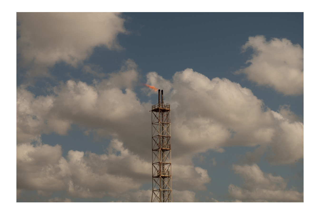
PHOTO 18: Gela, refinery. Torch chimney in operation. The torches burn the gases eliminated in the production plant.