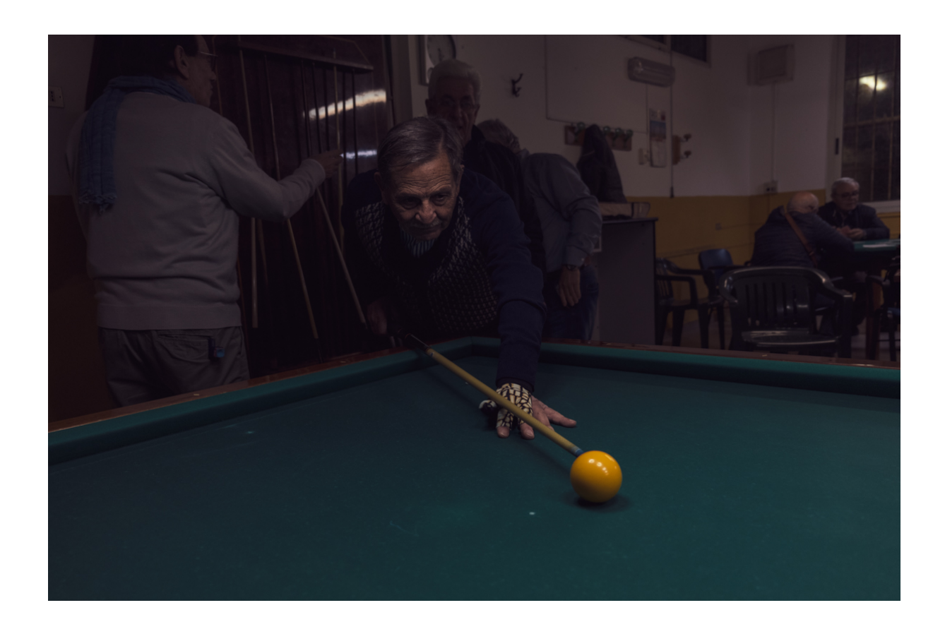
Рното 6: Gela, Macchitella district. Billiard room inside the Eni Group Club. In the 1960s the neighbourhood was equipped with a series of unimaginable comforts for the local inhabitants, such as the continuous availability of drinking water and health, commercial and cultural services, such as a hospital, a shopping centre and a cinema-theatre.