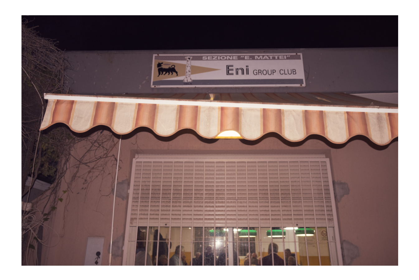
PHOTO 5: Gela, Macchitella District, Eni Group Club. Section "E. Mattei". The neighbourhood was created in the 1960s as a satellite of the petrochemical centre. Totally separated in urban and social terms from the rest of the city, it offered accommodation to Eni employees.