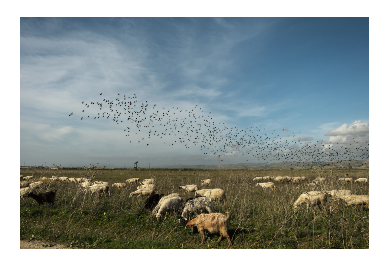
PHOTO 2: Herd grazing in the Gela countryside. In the background, on the left, a drill for oil extraction. In 1956, at a depth of 3400 metres, the first oil field was established in the Piana del Signore.