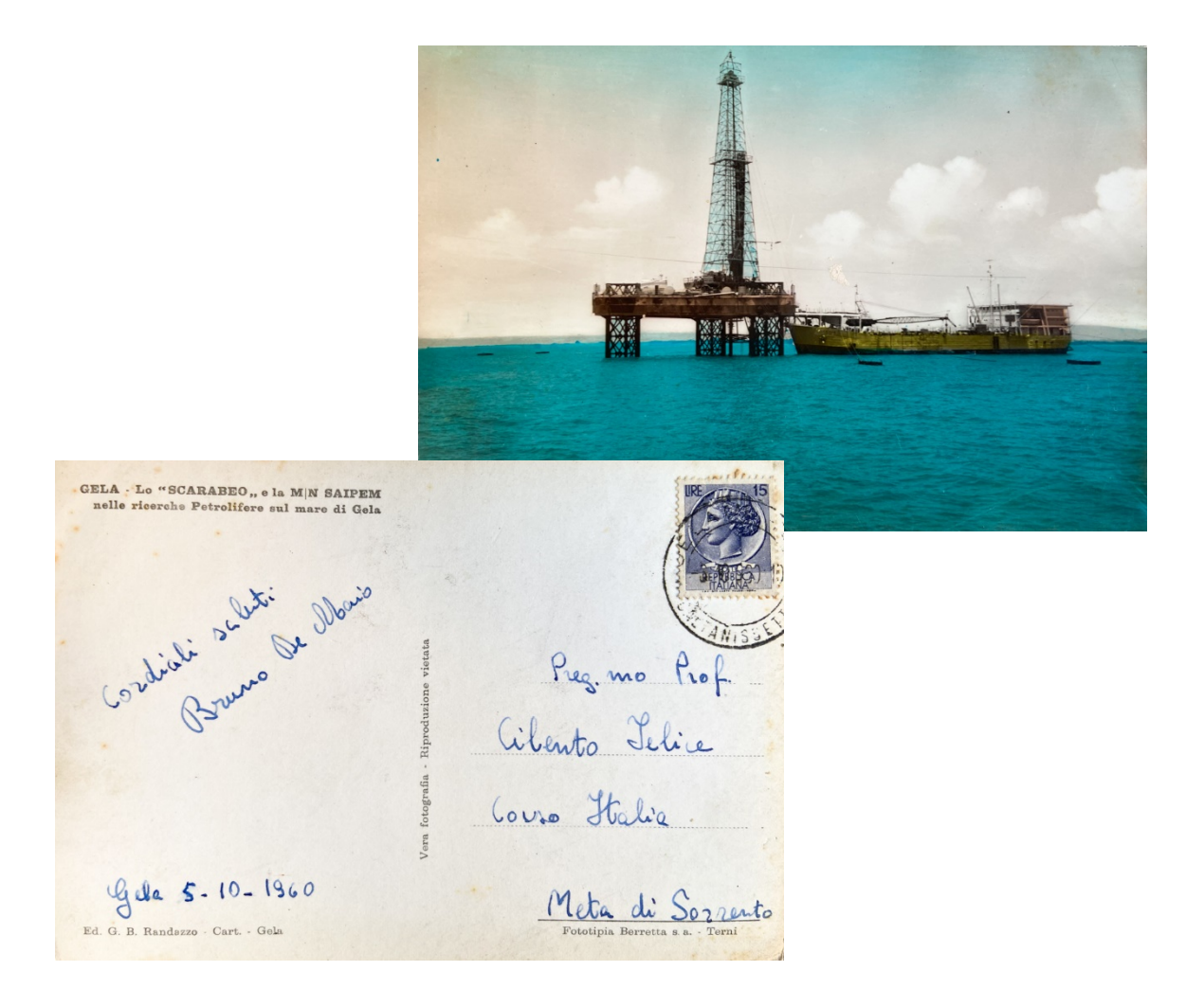
PHOTO 10: The first offshore drilling rig in Europe (1958), built in the United States and called "Scarabeo", together with the Saipem motor ship, used for oil exploration at sea. Postcard.