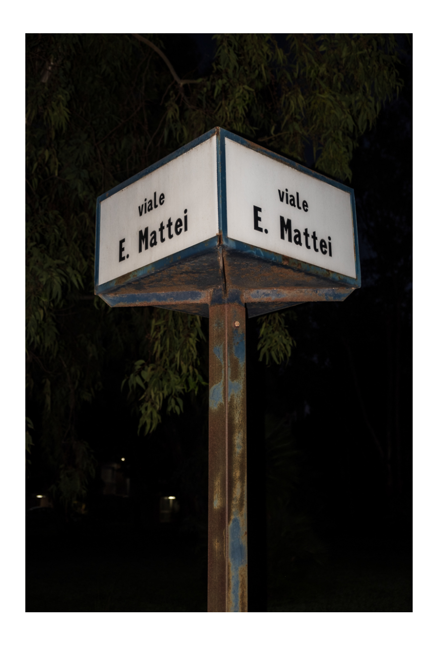
PHOTO 16: In the Macchitella district, the streets bear the names of the Eni executives; this one in particular is dedicated to Enrico Mattei, the founder of Eni.