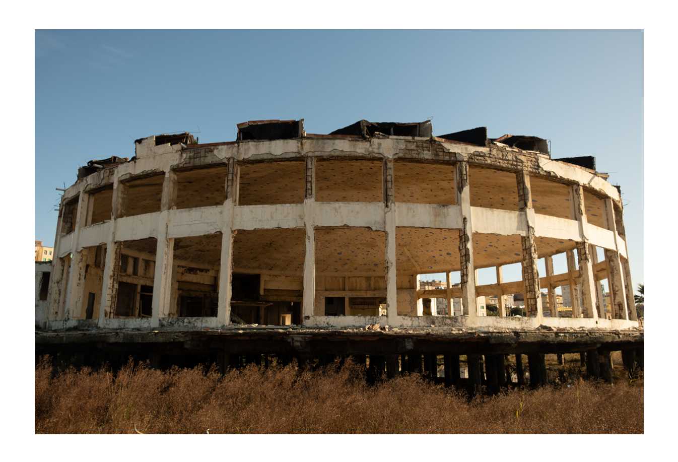
PHOTO 12: The remains of the "Conchiglia" today. Its decline began in the 1980s, mainly due to oil pollution of the waters and sea currents that caused a progressive retreat of the coast. Today the structure is under seizure.