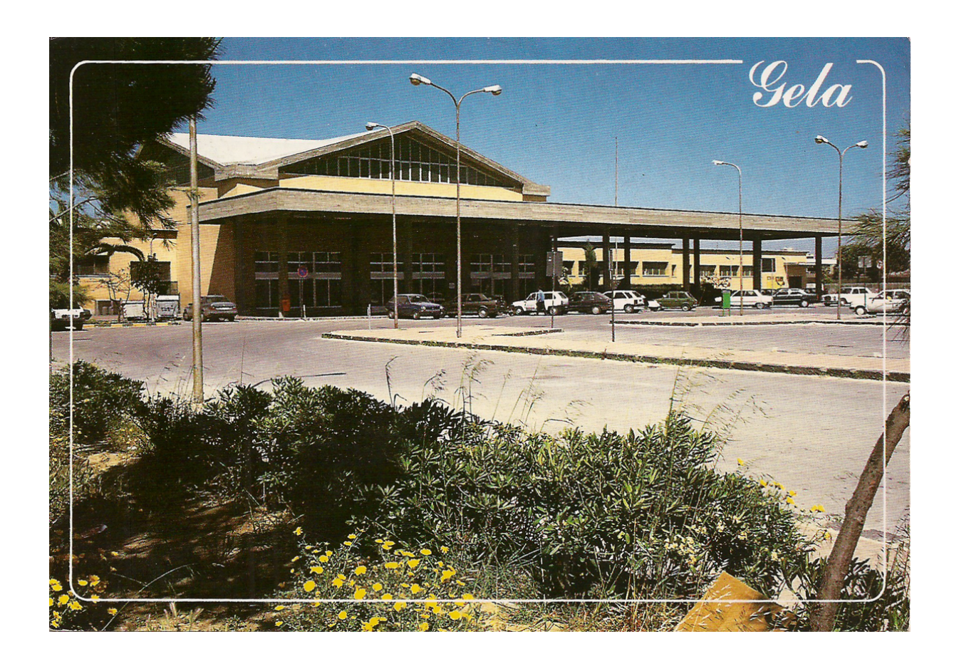
Рното 1: Gela, train station. Postcard.