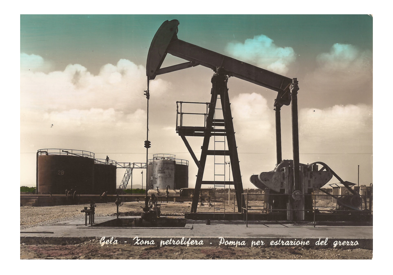
PHOTO 17: Gela. Oil area - pump for the extraction of crude oil. Postcard.