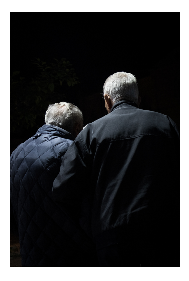
PHOTO 15: The effects of pollution on the health of the local population are devastating. Numerous medical reports have established the correlation between the presence of different polluting chemicals and the high rates of cancer.