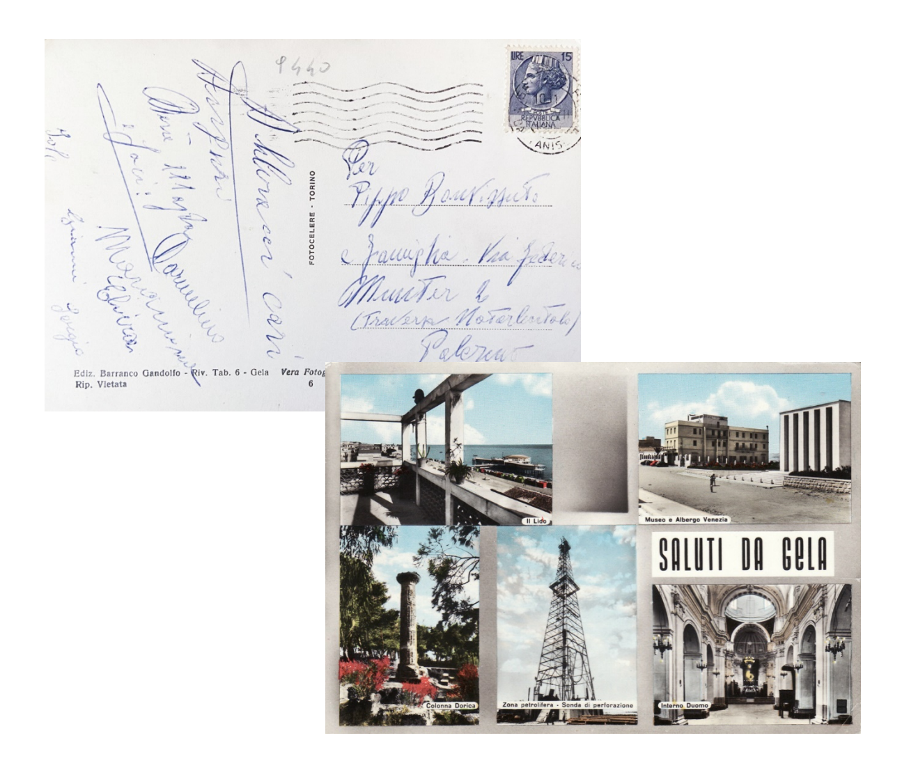
PHOTO 19: "Greetings from Gela". Postcard. Among the sites of interest in the city, also the drilling probe of the oil zone.