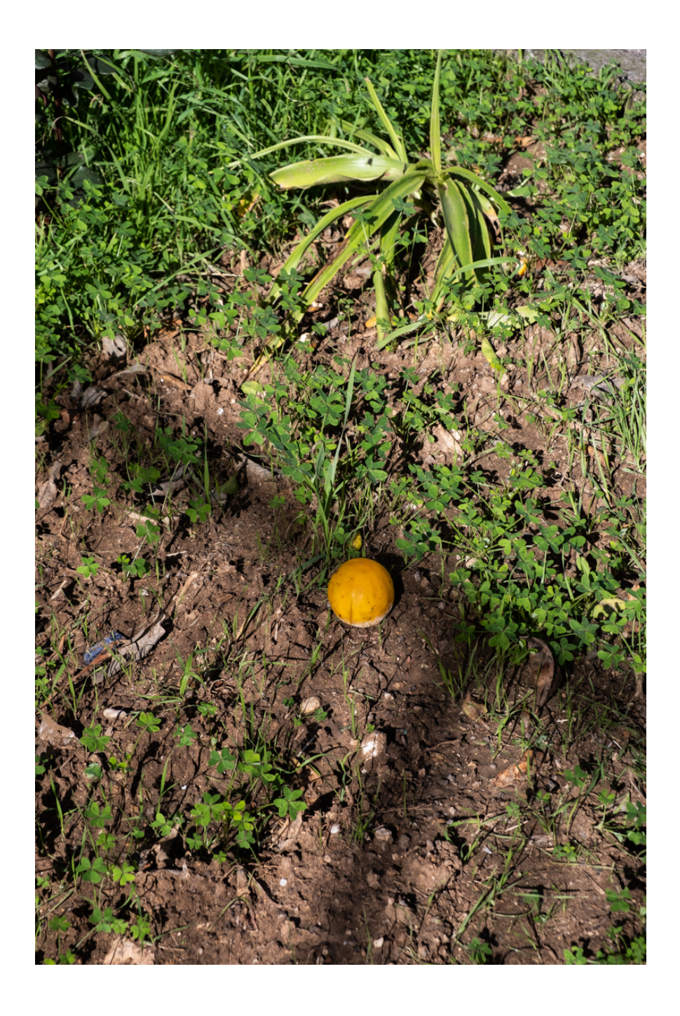
PHOTO 7: Until the industrial boom of the 1960s, Gela and the surrounding areas were mainly characterised by an agricultural economy. Today the land, the air and the aquifers are severely compromised by the damage of emissions, plant losses and the spill of pollutants.