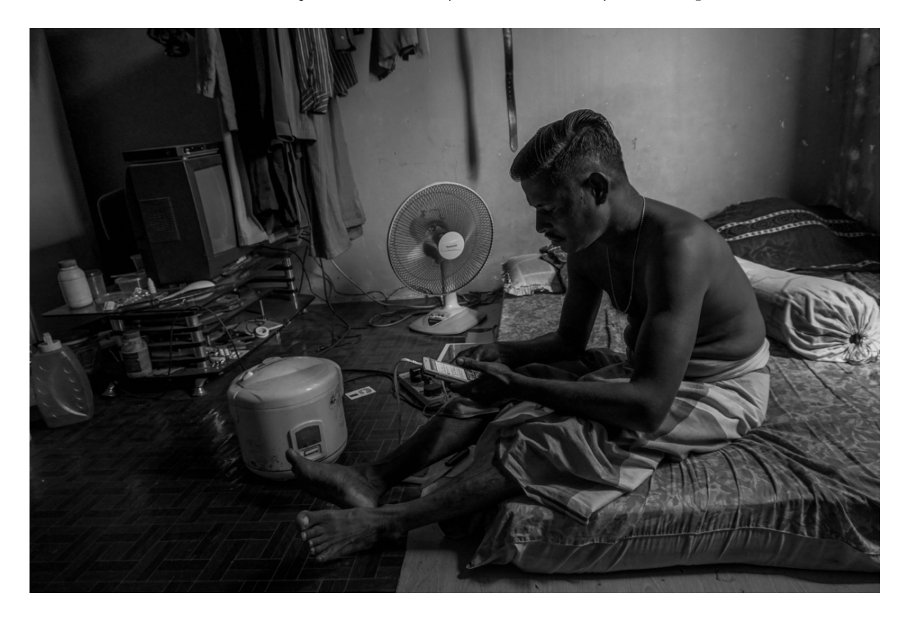
PHOTO 13 : What makes an essence of a home? For a lot of foreign workers, maybe it is just a place that can make do with living