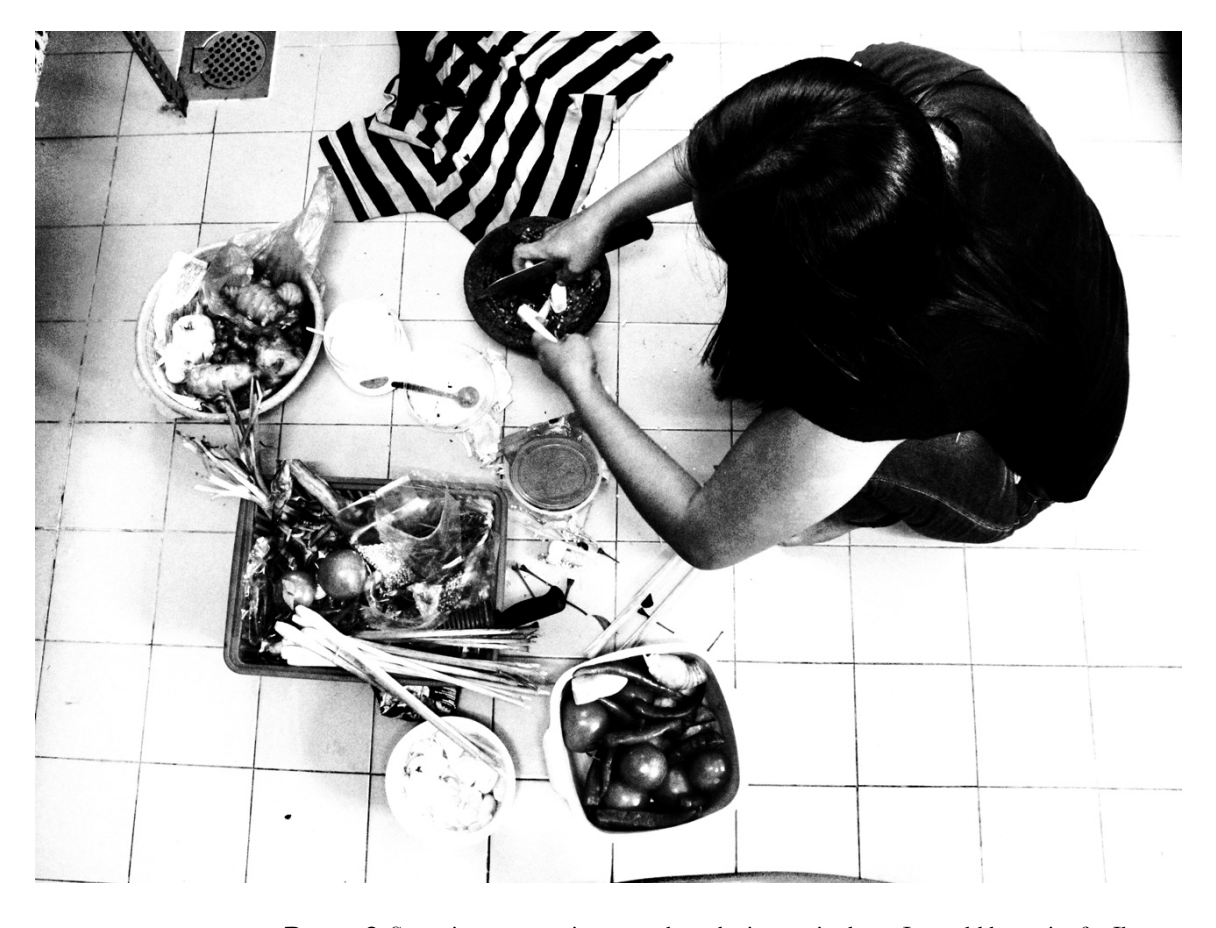
Рното 2 : Sometimes, preparing a meal can be improvised too. It would be easier for Ihen to prepare such an abundant of ingredients and spices on floor rather than on the table