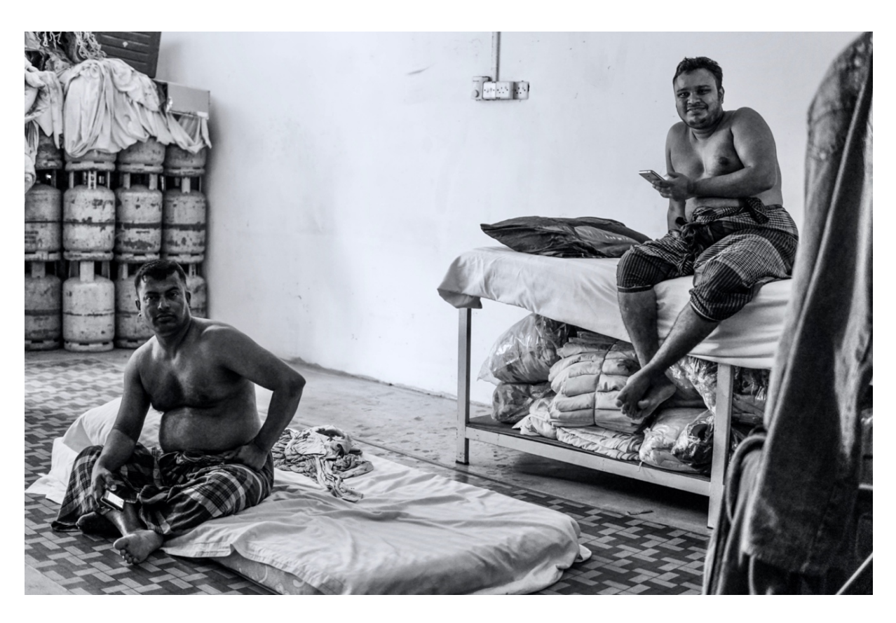
Рното 20 : He lives upstairs from the shop where he works with two of his friends, in a small room packed with belongings and daily necessities