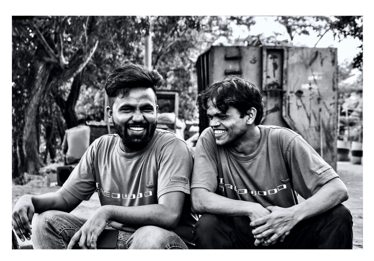
PHOTO 7 : Two of the foreign workers friends of Ahsan in Redwood company, chitchatting during the break