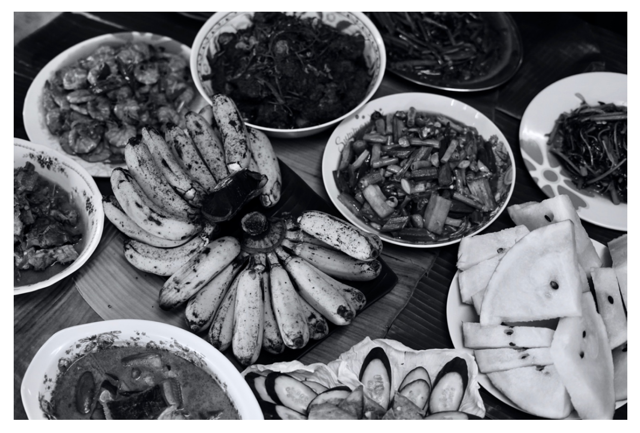
PHOTO 4 : A sumptuous meal is the best way to ease themselves from missing home