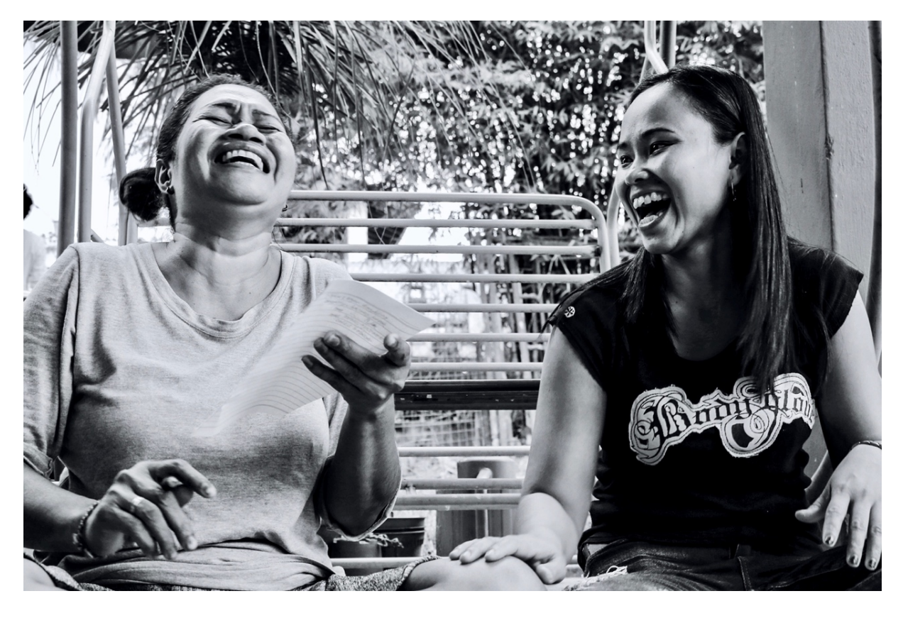
PHOTO 6 : To have a friend to share the joy and sorrow, life seems easier too