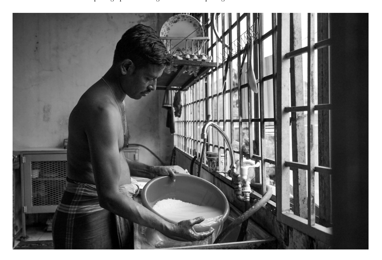
PHOTO 15 : Rice is the staple food for most of the Asian people, even a simple meal cannot be short of rice