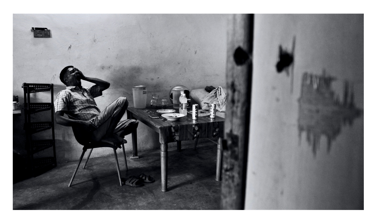
PHOTO 16 : A chair and a table form a simple living room, everything reduces to minimal