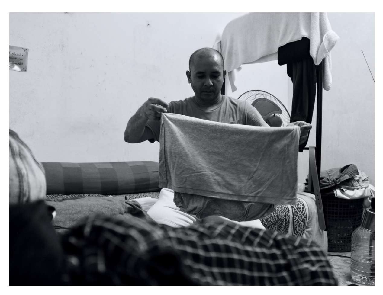
PHOTO 18 : All the clothing is folded in systematic and organised way – a long term side-effect of his daily work