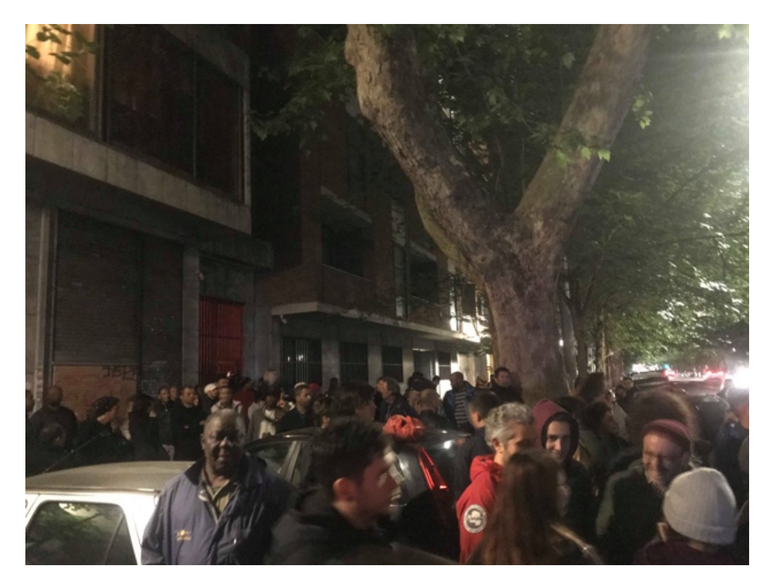
PHOTO 6 : The sit-in, right after the Pope's almsgiver restored electricity to the building

they may use in varying configurations to solve different kinds of problems, like that of using shared housing precariousness as a starting point before transforming themselves into a political subject. In this regard, Ann Swidler wrote that culture influences action not by providing the ultimate values toward which action is oriented, but by shaping a repertoire of habits, skills, and styles from which people construct strategies of action (1986) since culture is, according to this interpretation, the publicly available symbolic forms through which people experience and express meanings (Kessing 1974). Therefore, Swidler identifies two models through which culture shapes action: settled periods, when culture independently influences action by providing resources from which people can construct diverse lines of action; unsettled periods, when explicit ideologies directly govern action, but structural opportunities for action determine which among competing ideologies survive in the long run.