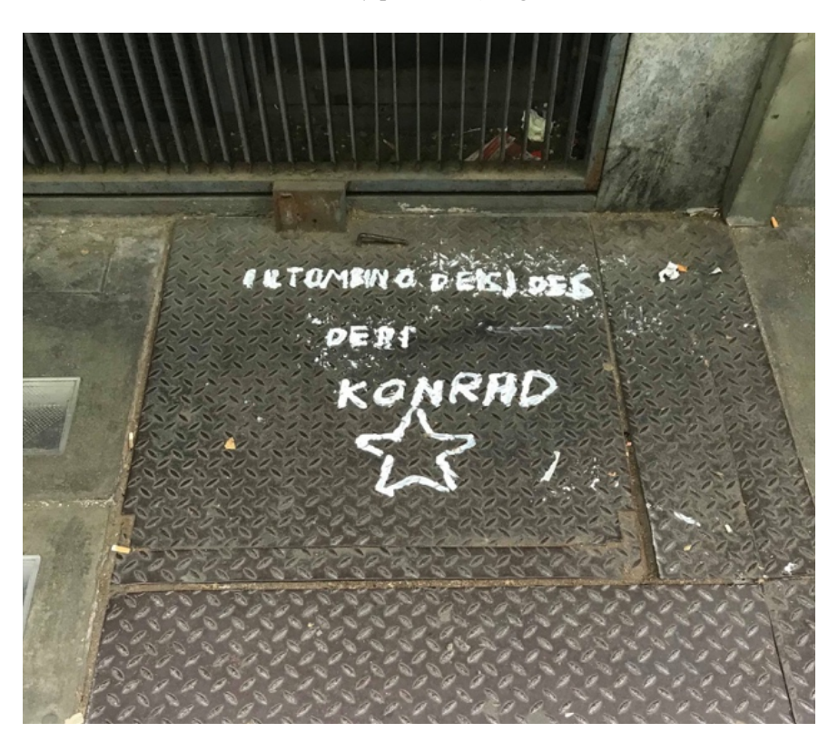
PHOTO 7 : The manhole cover where the building's electrical system is found. After that night, it has been 'patrimonialized' by squatters as a place of worship

By shifting the analytical focus from crisis in context to crisis as context (Vigh 2008), housing precarity in Rome would then become definable as a condition, rather than as an episode. Even if "most of the time we imagine such precarity to be an exception to how the world works", in fact, "precarity is the condition of our time" and for this reason, as anthropologists, "we have no choice other than to look for life in this ruin" (Tsing 2015: 6). Given its state as a discipline strongly rooted in the field, together with a particular attention on theory and policy, anthropology with its ethnographic approach could become the perfect interpreter of the consequences of large-scale global processes on lived life, since these processes are often forged at such a distance from the lives they affect that they appear to be unrelated and indifferent to the effects they produce (Ferguson 1999; Nordstrom 1997, Vigh 2008).