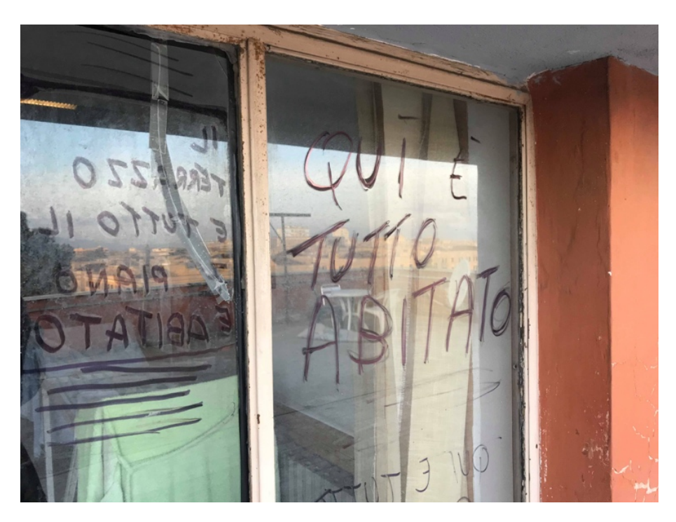
PHOTO 1: Slogans in the squat under analysis: "Here everything is inhabited".

and deprivation, to have manifold experiences of stable precarity that can be interpreted for some squatters as an active search for social legitimacy (Manocchi 2012) and, conversely, for others, as an attempt to conquer the privilege of being invisible (Appadurai 2003) represented by the condition of having a roof, however precarious. In the two concluding sections, I introduce the local moral economy (Fassin 2009; 2015). I also describe how the occurrence of an event such as the Pope's almsgiver restoring electricity in the building has led me to conceive of Santa Croce /Spin Time as a culture that constantly shapes collective action (Swidler 1986).