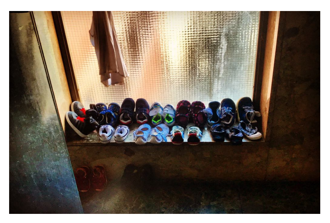
PHOTO 3 : Children's shoes in the squat, lined up to dry after being washed in a shared washing machine

although little known in relation to urban studies in Western countries — undertook studies involving young people in Bissau and wrote that, from their point of view, crisis and conflict are almost never seen as passing phenomena. Constant decline has actually led to the emergence of social, economic, political and identificatory decay, with the consequence that critical events are set against a background of persistent conflict and decline (2008: 6). For young people in Bissau, war is no longer seen as an exception but a recurrent event. Vigh therefore states that rather than taking a traditional social science approach to the phenomenon by placing a given instance of crisis in its historical context, as anthropologists we should be able to see crisis as context (Vigh 2006): that is, as a terrain of action and meaning rather than a single episode, which can then lead us to an understanding of critical states as pervasive contexts rather than singular events.